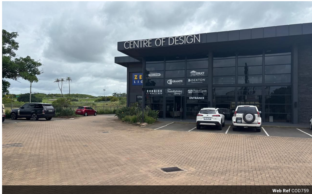
Web Ref COD759

Suite 1 ComProp House Kyalami Park, Douglas Crowe Avenue, Ballito Business Park, 4420