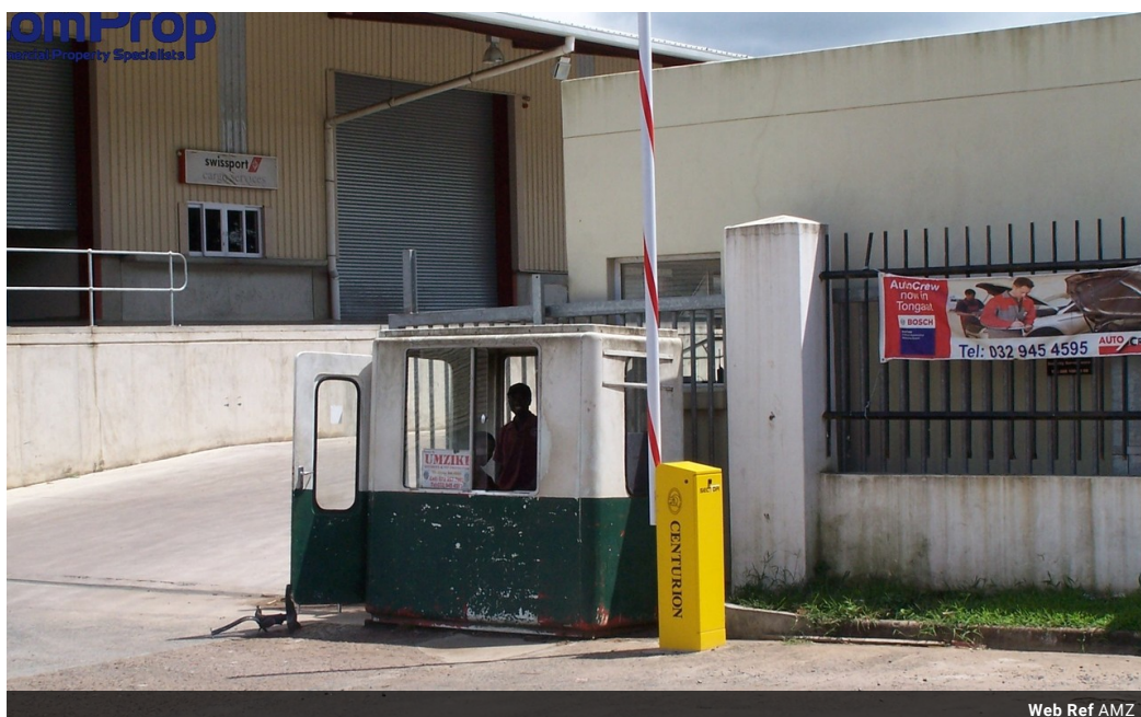
Web Ref AMZ

Suite 1 ComProp House Kyalami Park, Douglas Crowe Avenue, Ballito Business Park, 4420