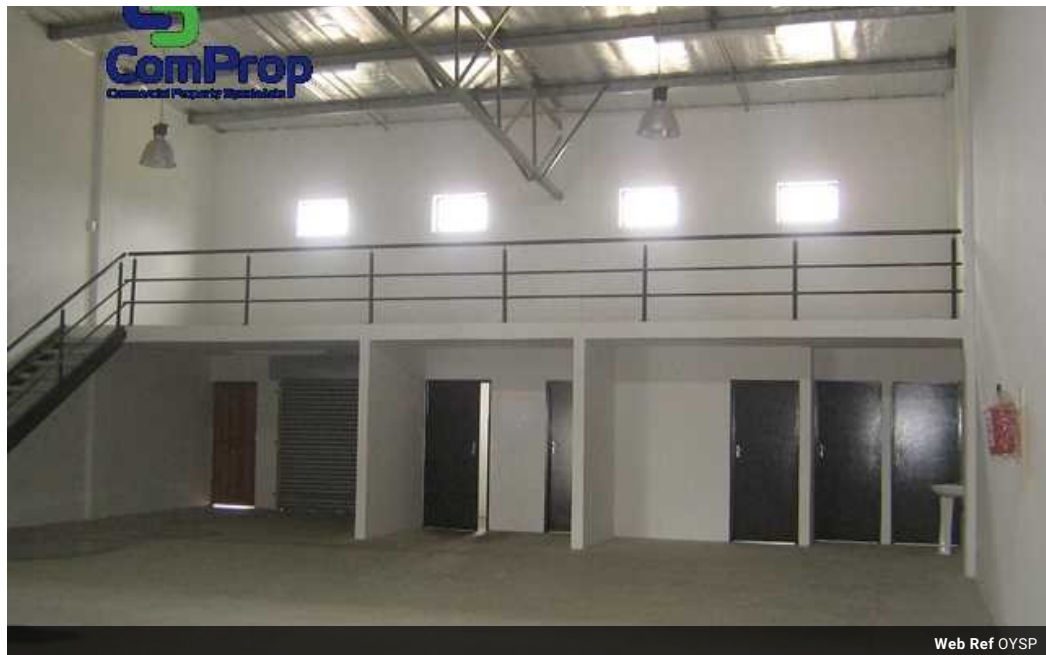
Web Ref OYSP

Suite 1 ComProp House Kyalami Park, Douglas Crowe Avenue, Ballito Business Park, 4420