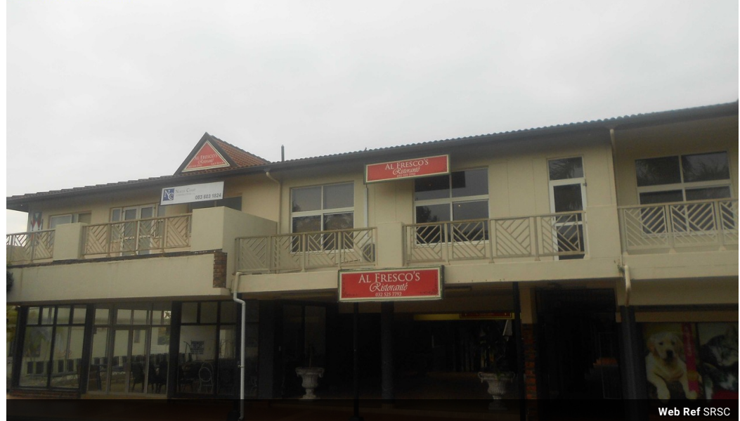
Web Ref SRSC