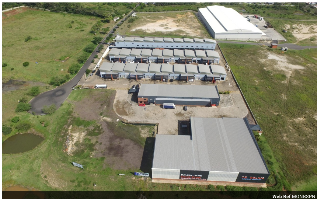
Web Ref MONBSPN

Suite 1 ComProp House Kyalami Park, Douglas Crowe Avenue, Ballito Business Park, 4420