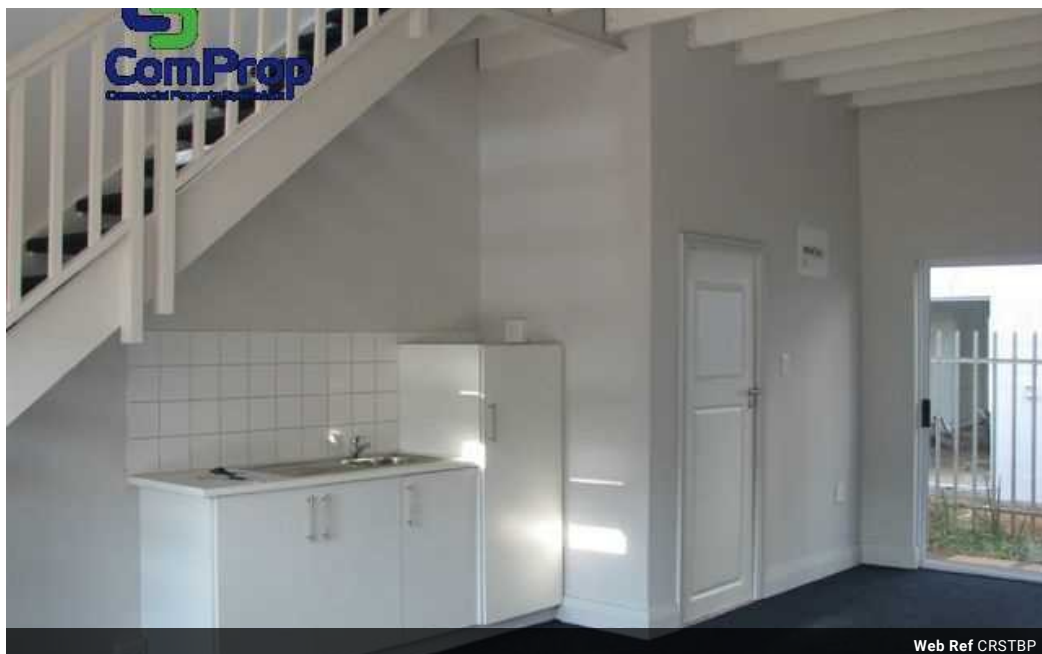
Web Ref CRSTBP

Suite 1 ComProp House Kyalami Park, Douglas Crowe Avenue, Ballito Business Park, 4420