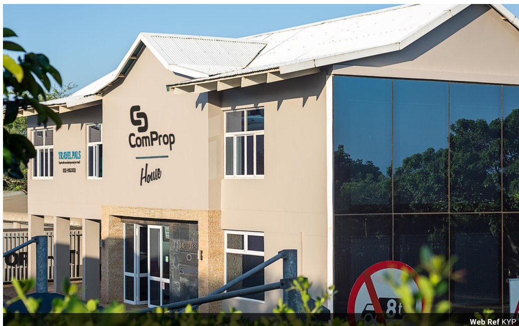
Web Ref KYP

Suite 1 ComProp House Kyalami Park, Douglas Crowe Avenue, Ballito Business Park, 4420