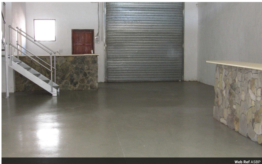
Web Ref ASBP

Suite 1 ComProp House Kyalami Park, Douglas Crowe Avenue, Ballito Business Park, 4420