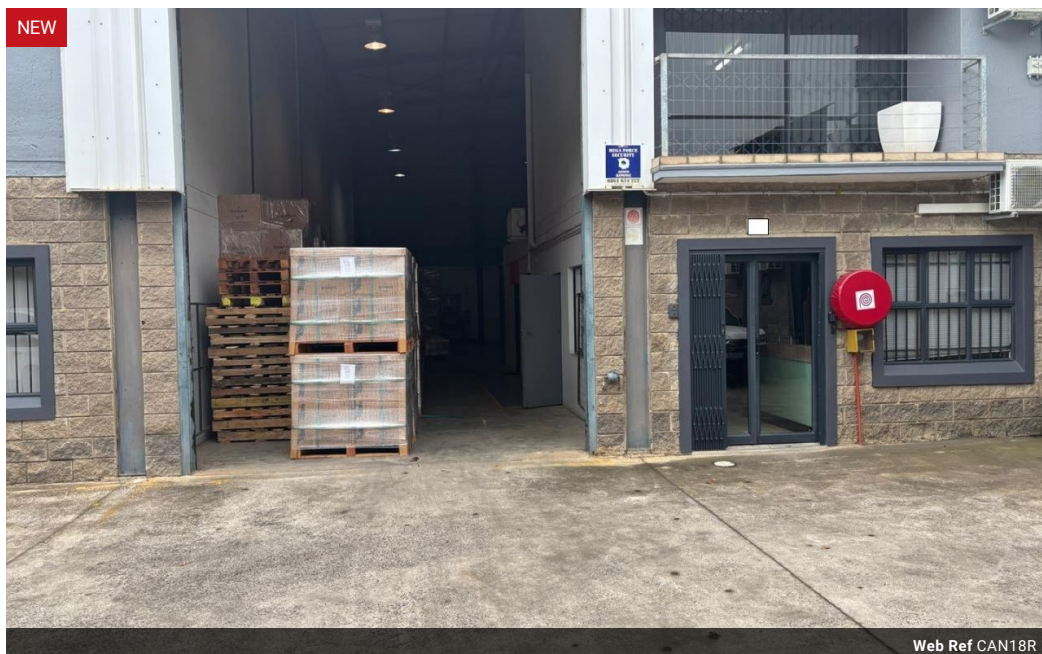
Web Ref CAN18R

Suite 1 ComProp House Kyalami Park, Douglas Crowe Avenue, Ballito Business Park, 4420