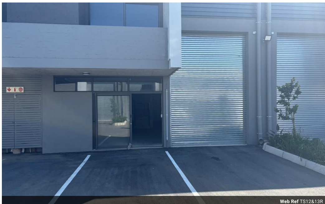
Web Ref TS12&13R

Suite 1 ComProp House Kyalami Park, Douglas Crowe Avenue, Ballito Business Park, 4420