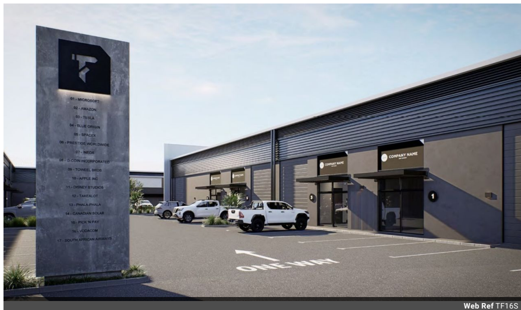
Web Ref TF16S

Suite 1 ComProp House Kyalami Park, Douglas Crowe Avenue, Ballito Business Park, 4420