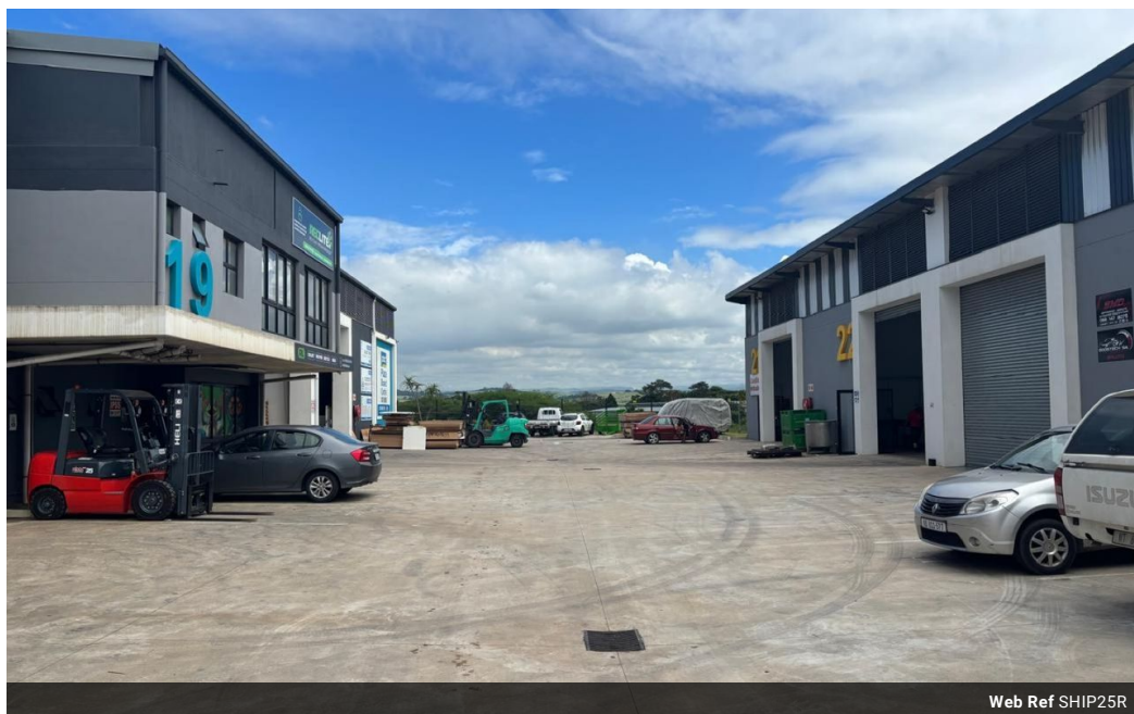
Web Ref SHIP25R

Suite 1 ComProp House Kyalami Park, Douglas Crowe Avenue, Ballito Business Park, 4420