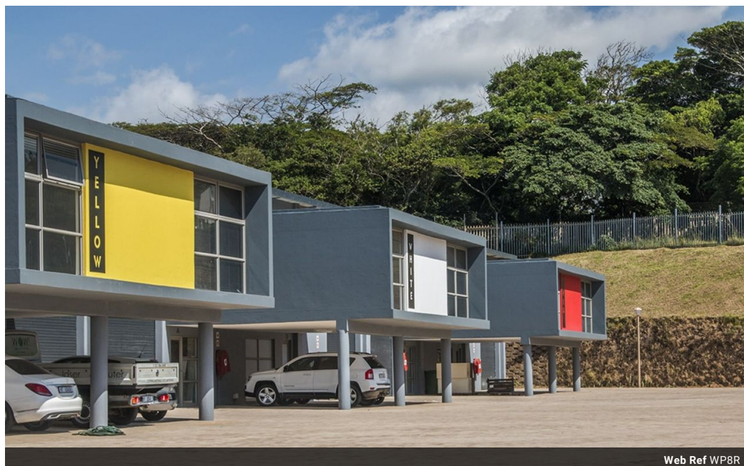
Web Ref WP8R

Suite 1 ComProp House Kyalami Park, Douglas Crowe Avenue, Ballito Business Park, 4420