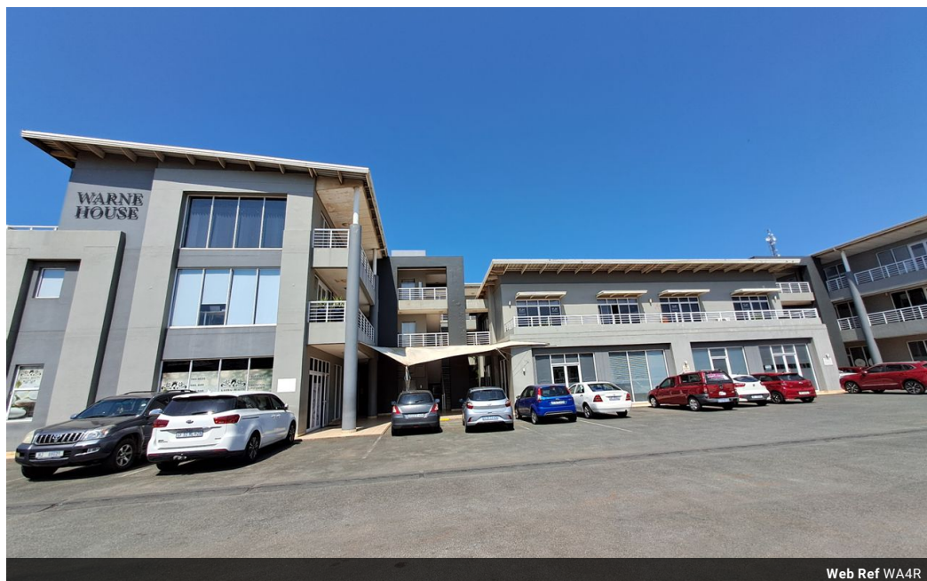
Web Ref WA4R

Suite 1 ComProp House Kyalami Park, Douglas Crowe Avenue, Ballito Business Park, 4420