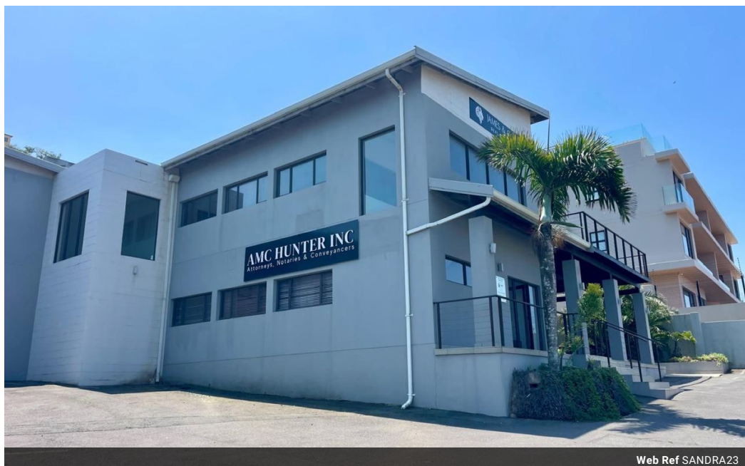
Web Ref SANDRA23

Suite 1 ComProp House Kyalami Park, Douglas Crowe Avenue, Ballito Business Park, 4420