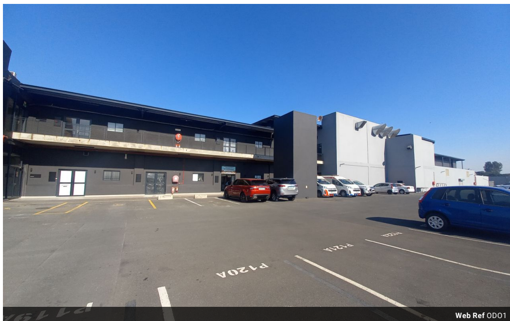
Web Ref OD01

Suite 1 ComProp House Kyalami Park, Douglas Crowe Avenue, Ballito Business Park, 4420