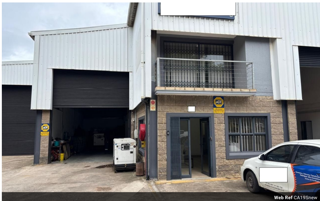
Web Ref CA19Snew

Suite 1 ComProp House Kyalami Park, Douglas Crowe Avenue, Ballito Business Park, 4420