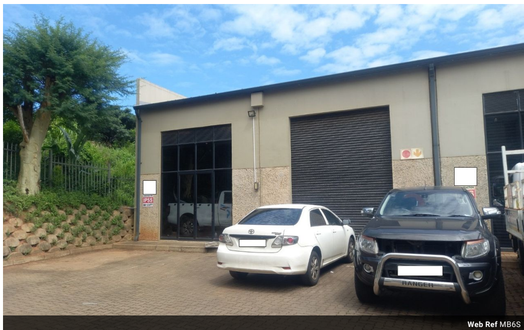
Web Ref MB6S

Suite 1 ComProp House Kyalami Park, Douglas Crowe Avenue, Ballito Business Park, 4420