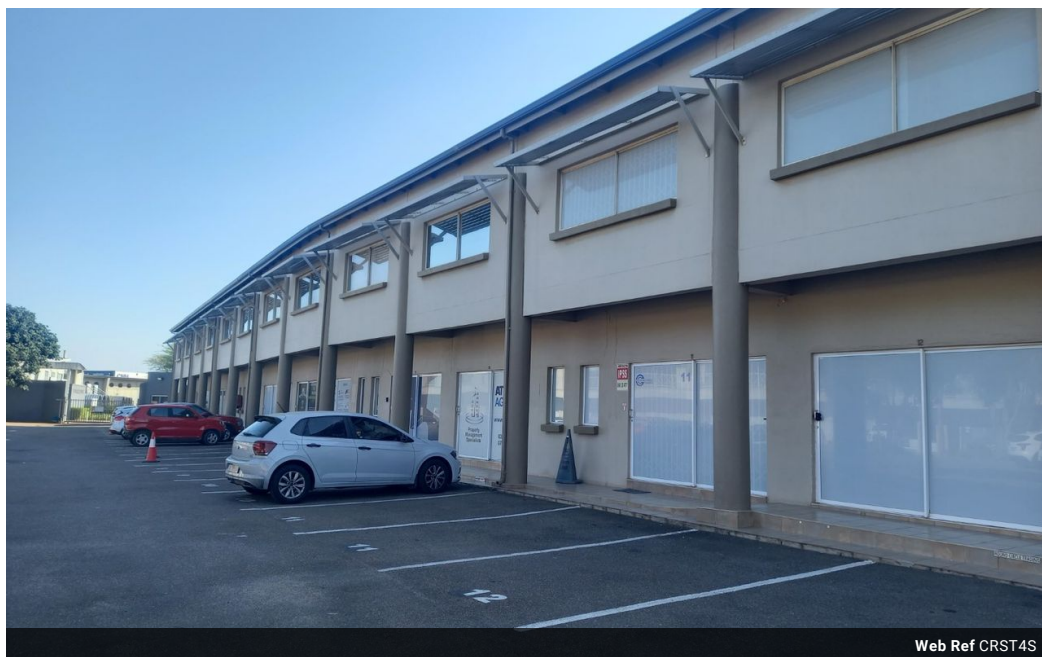
Web Ref CRST4S

Suite 1 ComProp House Kyalami Park, Douglas Crowe Avenue, Ballito Business Park, 4420