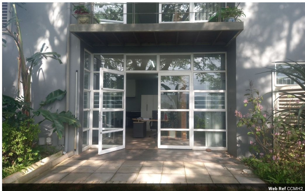
Web Ref CCMH2

Suite 1 ComProp House Kyalami Park, Douglas Crowe Avenue, Ballito Business Park, 4420